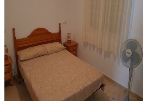
Important Notice: These details have been produced in good faith and are believed to be accurate based upon the information supplied but they are not intended to form part of a contract. You are strongly advised to check the availability of the property before travelling any distance to view. Any intending purchasers must satisfy themselves by inspection or otherwise as to the correctness of each of the statements contained in these particulars.