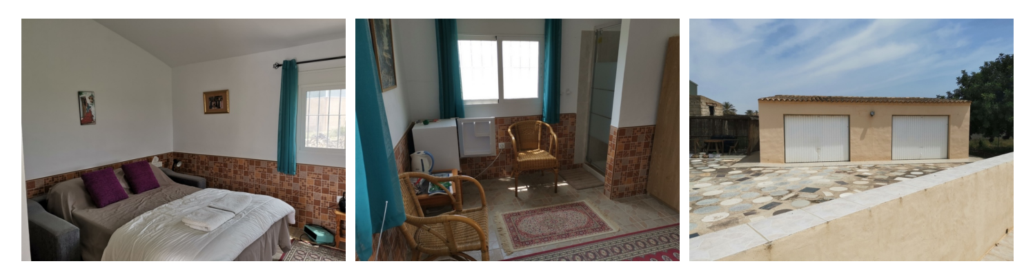
Important Notice: These details have been produced in good faith and are believed to be accurate based upon the information supplied but they are not intended to form part of a contract. You are strongly advised to check the availability of the property before travelling any distance to view. Any intending purchasers must satisfy themselves by inspection or otherwise as to the correctness of each of the statements contained in these particulars.

A large country property located in Valladolsis Cartegena. As you approach the front of the property through the electric gates, there is a large area, ample space for several vehicles. As you enter the property the lounge is spacious and it even has a bar, the dining area is also in the lounge, and presently combines seating with the dining area. There is satellite Freeview installed and a log burner. A further large bedroom is on the upper level to the property, one a double and the other easily accommodates bunk beds. There is an en-suite bathroom to this extra large bedroom, this en-suite has a corner bath. To the front of the property is a patio and entertaining area with a swimming pool 8 x 4mts. Plus a fantastic self contained annex comprising of, 1 bedroom, and shower room. Located just 10 minutes drive from the popular town of Fuente Alamo and 15 minutes from Corvera airport, and 1 hour from Alicante airport.